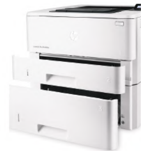
HP LaserJet Pro M402dn with optional 550-sheet tray