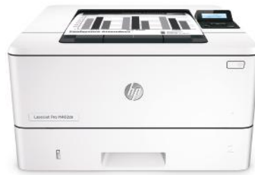
HP LaserJet Pro M402dn

Printing performance and robust security built for how you work. This capable printer finishes jobs faster and delivers comprehensive security to guard against threats. 1 Original HP Toner cartridges with JetIntelligence give you more pages. 2